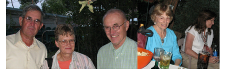
Some images from the Governors visit!