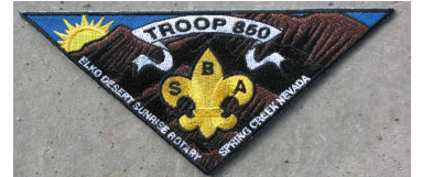
Popcorn is being sold by the troop we sponsor!!!